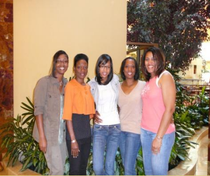
BEMI Boy's Youth Director & Mentor's