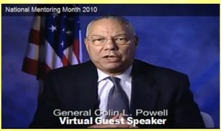
National Mentoring Month 2010