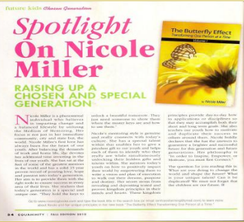
BEMI Girl's Youth Director & Mentor's